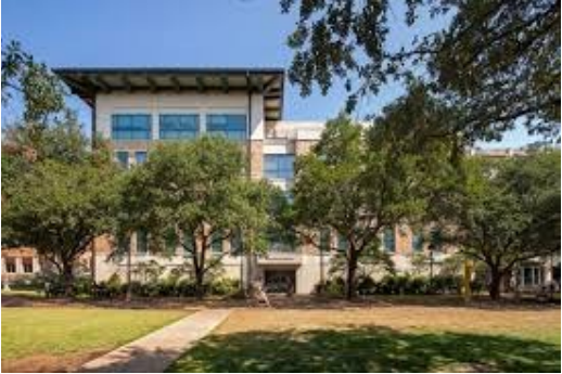
The Jackson School of Geosciences Building (JGB)