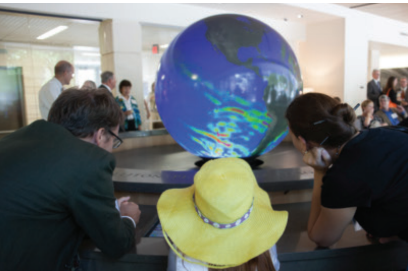
The BhP Billiton Petroleum Magic Planet will be a teaching tool for our undergraduates, K-12 students and our guests.